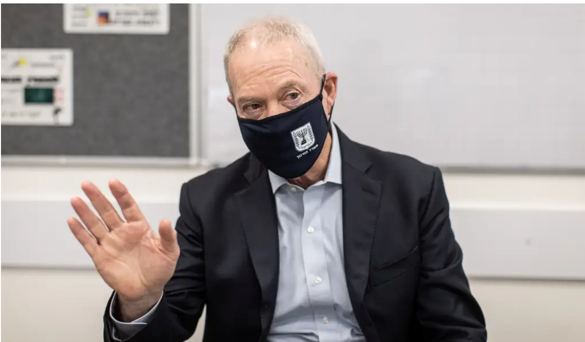
Education Minister Yoav Gallant