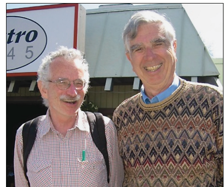
Doron Zeilberger, Herb Wilf, Gainesville, 2005.

One day during dinner at the famous Moosewood Restaurant in Ithaca, NY, Herb took me and Doron aside and proposed that we write a book about automated proofs of identities involving hypergeometric sums. We agreed, and Herb drafted the table of contents for nine chapters, which we divided